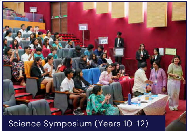
Science Symposium (Years 10-12)