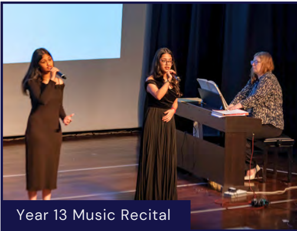
Year 13 Music Recital