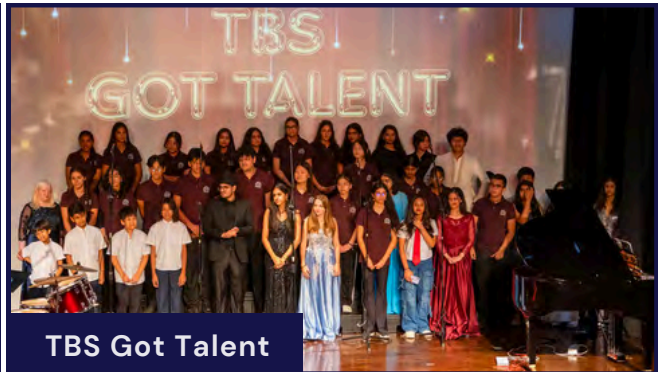
TBS Got Talent