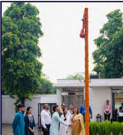
Independence Day Assembly