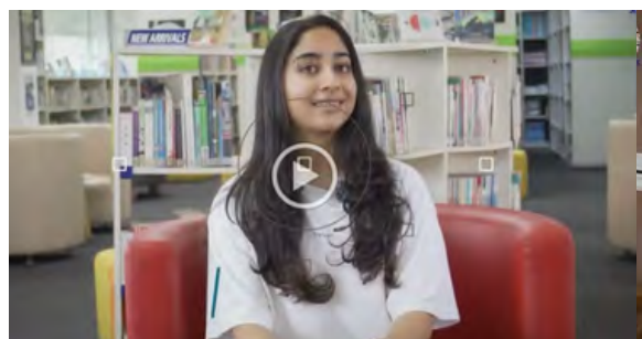
IBDP: Preparing for Life