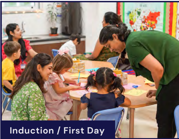
Induction / First Day