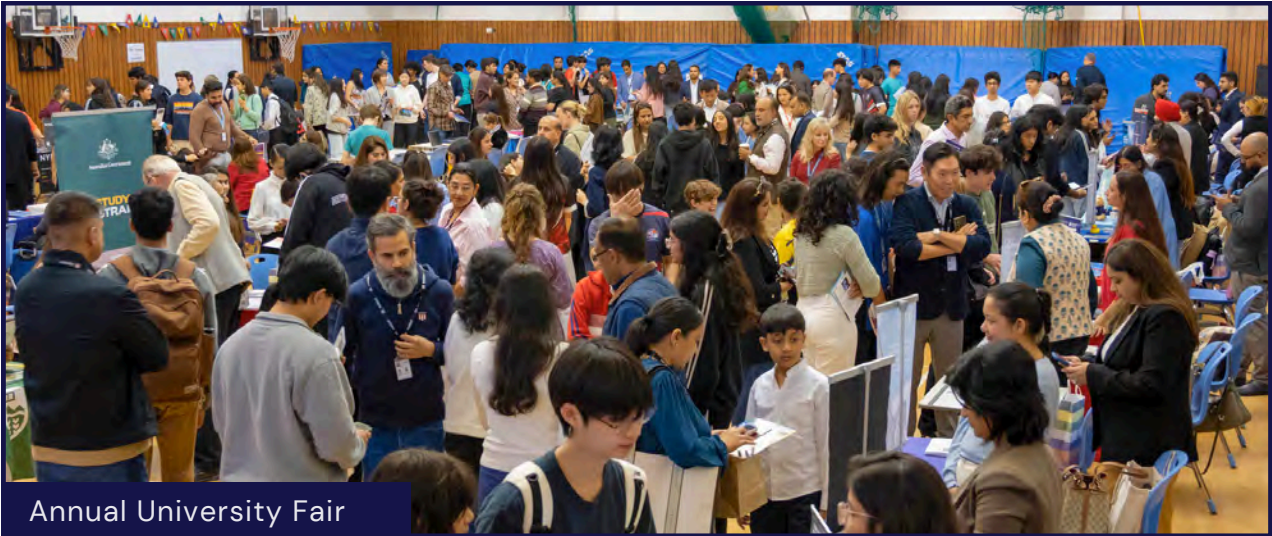
Annual University Fair