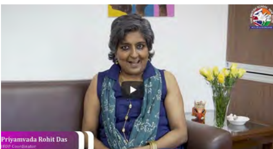
IBDP: Teacher Experiences