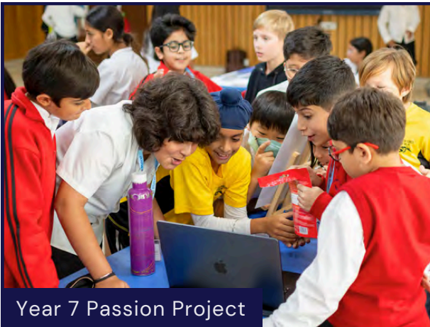
Year 7 Passion Project