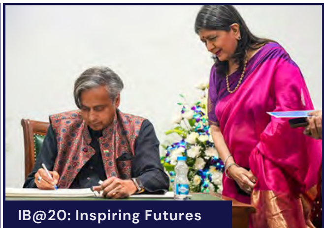
IB@20: Inspiring Futures