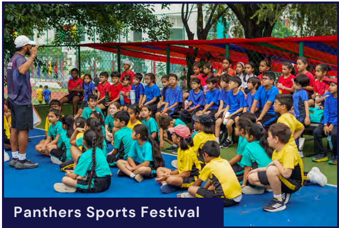
Panthers Sports Festival