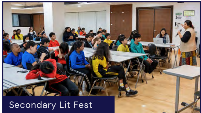
Secondary Lit Fest